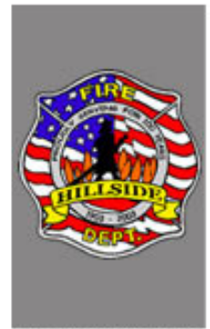
PORTRAIT, 3' x 5' SUITABLE FOR SINGLE DOORS