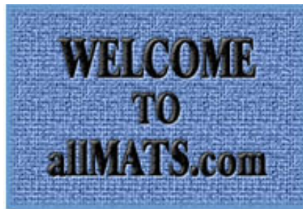
LANDSCAPE, 4' x 6' SUITABLE FOR DOUBLE DOORS

Use the pictures and chart below to indicate the logo position. For center positioning, the size of the logo will fill the dimensions of the mat unless you specify differently. For all other positions, please notify us with the exact size.