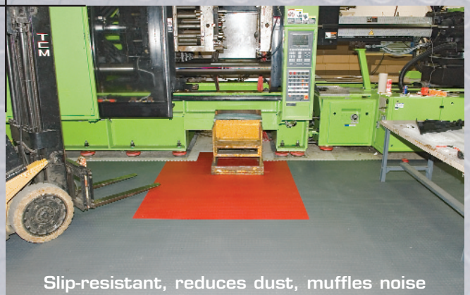
Slip-resistant, reduces dust, muffles noise