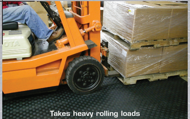
Takes heavy rolling loads