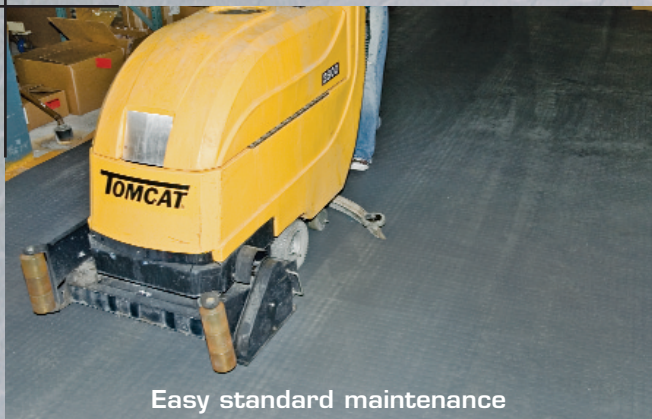
Easy standard maintenance