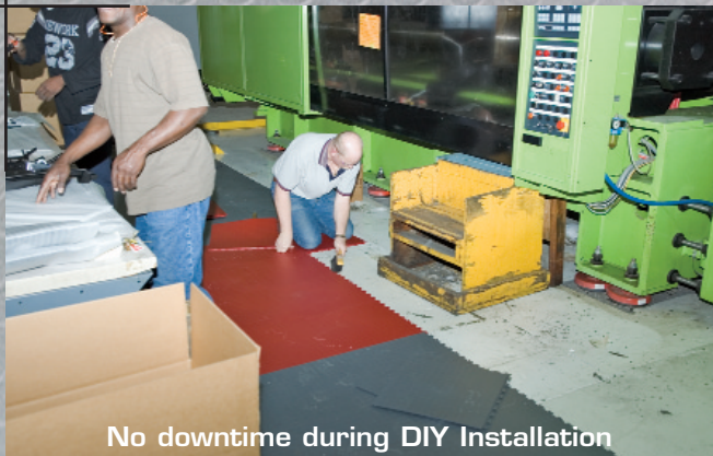
No downtime during DIY Installation